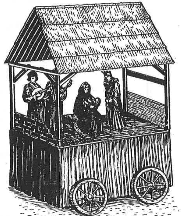
Cycles were sometimes presented on pageant wagons.

Theater had regained importance by the end of the Middle Ages. At the end of the era, writers began producing secular or non-religious plays again.